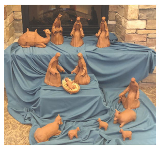
A terra cotta nativity set that was gifted to Resurrection Parish in Dawson Springs by a woman in Ohio for use in Resurrection's future church when it is rebuilt.

"I hope people won't forget about us," she said. "Even if you didn't have damage, you were affected. And our church isn't back yet."