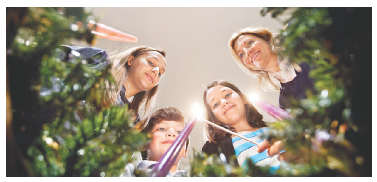
A family lights an Advent wreath at their Maryland home. This year, the First Sunday of Advent was celebrated the weekend of Nov. 27.

The point is not that he was a Muslim, although as Catholics our Catechism tells us that we share the same loving creator God as Muslims do, ("The plan of salvation also includes those who acknowledge the Creator, in the first place amongst whom are the Muslims; these profess to hold the faith of Abraham, and together with us they adore