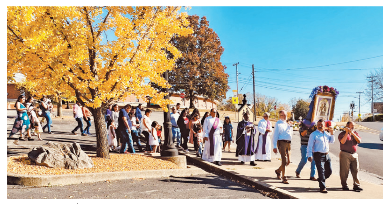
Una procesión para El Señor de los Milagros se lleva a cabo fuera de la Parroquia San Pedro & San Pablo en Hopkinsville en octubre pasado.

El Señor de los Milagros, una devoción peruana en Hopkinsville, Kentucky