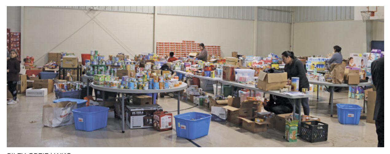
On Dec. 15, 2021, parishioners of St. Joseph in Mayfield operate a distribution center for survivors of the tornadoes that struck the region five days earlier.

She remembers "the outpouring of love" via