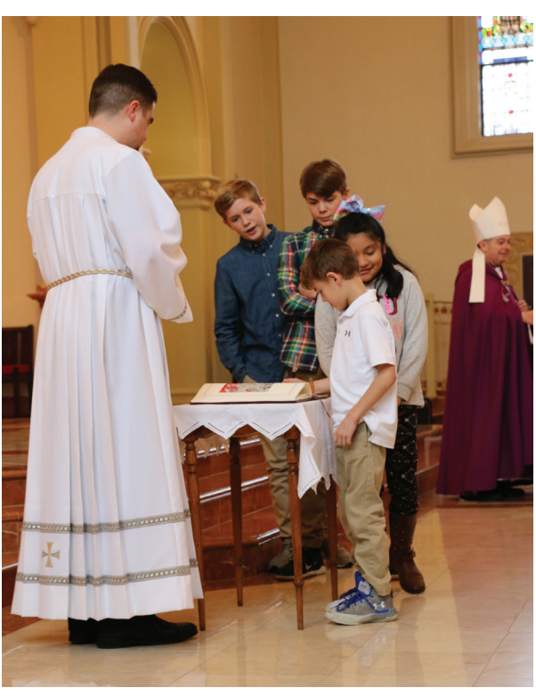
Several of the newly-elect write their names in the Book of the Elect. Only the elect – previously catechumens – sign this book because the candidates, by virtue of their baptism, already have their name symbolically in the "Book of Life."

"Neither of these are the actual meaning of the